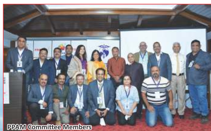
PPAM Committee Members