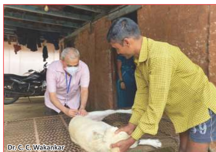
Dr. C. C. Wakankar