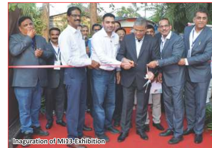
Inauguration of Mi13-Exhibition