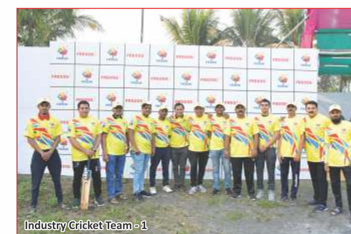
Industry Cricket Team - 1