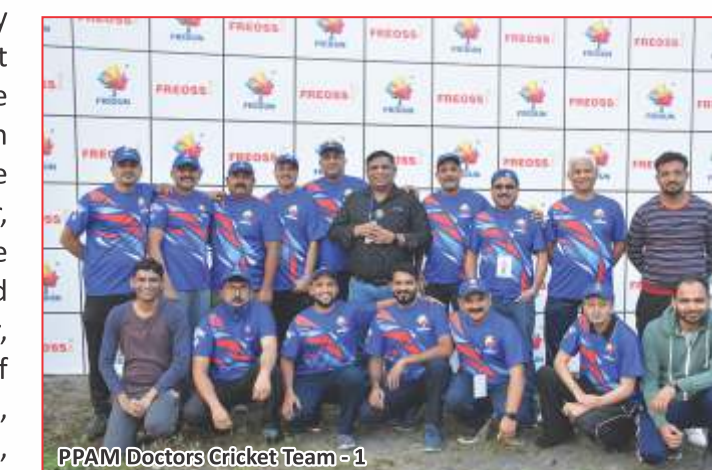
PPAM Doctors Cricket Team - 1