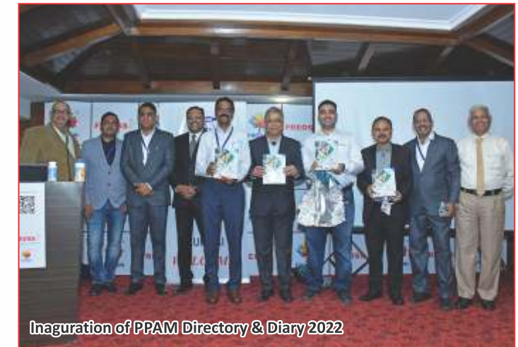
Inaguration of PPAM Directory & Diary 2022