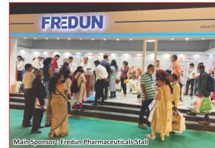
Main Sponsor: Fredun Pharmaceuticals Stall