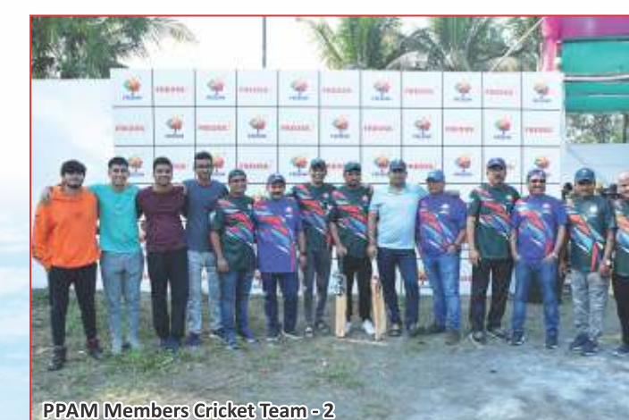
PPAM Members Cricket Team - 2