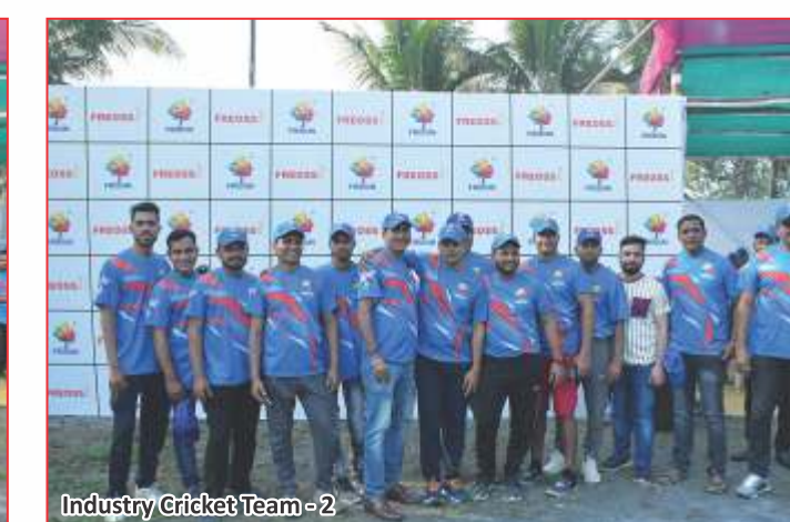
Industry Cricket Team - 2